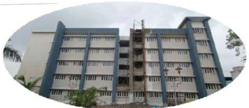
KARAIKAL CAMPUS BOYS HOSTEL