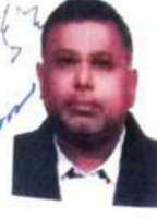
Chief Engineer, P.W.D., Chennai Region, Chepauk, Chennai-600 005.