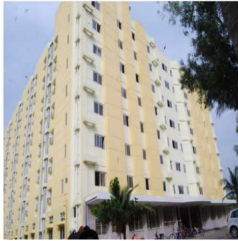
Construction of NRI PG Ladies Hostel Buildings at Sri Ramachandra University – Porur Chennai