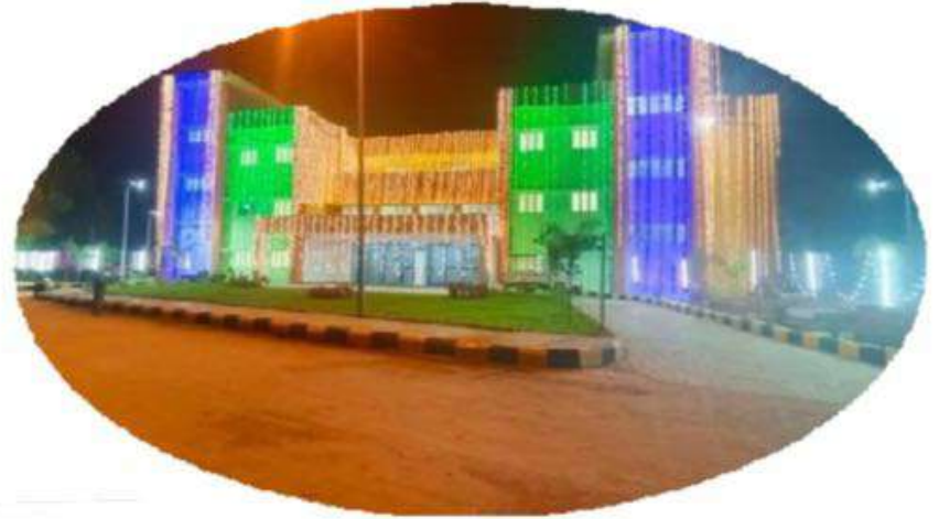
PHYSICAL EDUCATION BLOCK