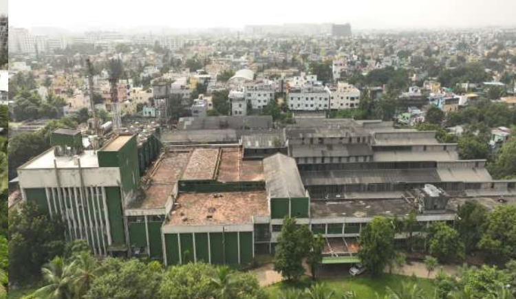
Construction of Mohan Breweries and Distilleries Ltd. Factory Buildings and Allied Works at Valasaravakkam, Chennai.