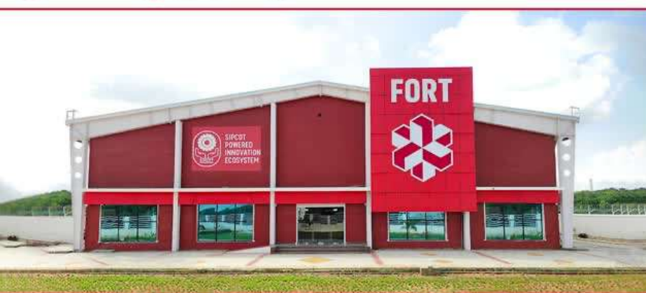
FORT.Chennai Inaugural Conclave