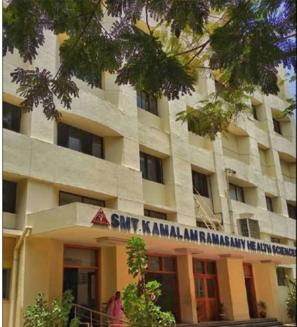
Construction of NRI PG Gents Hostel at Sri Ramachandra University – Porur Chennai