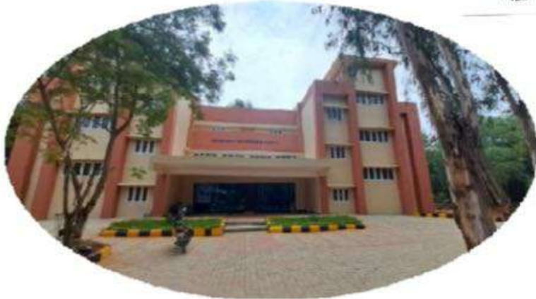
COMPUTER SCIENCE BLOCK